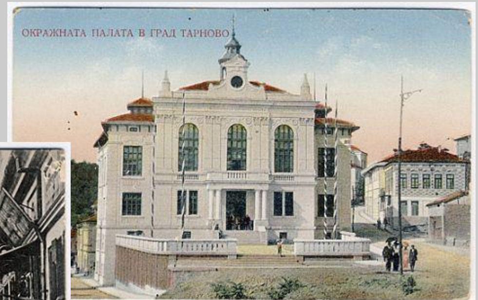
Veliko Tarnovo. Cityscapes.