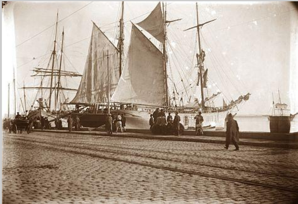
Photographs from a scientific Balkan expedition. 1912 - 1913