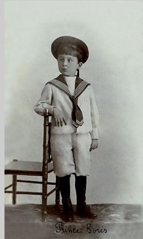
Boris III of Bulgaria as a child. ca. 1900