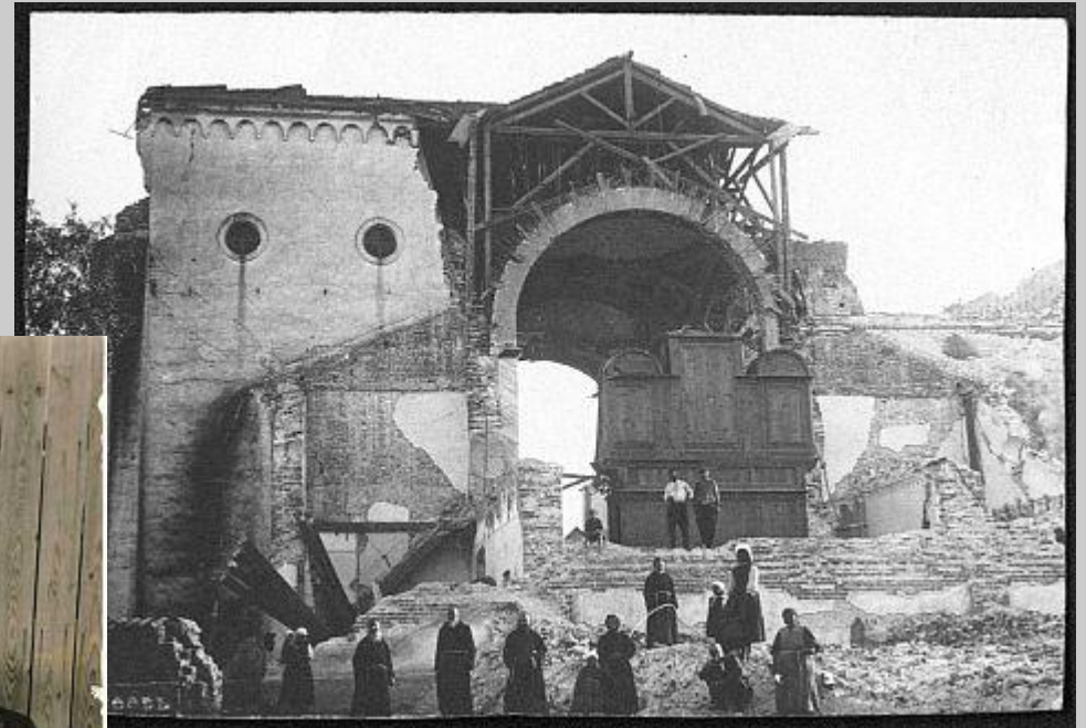
Earthquake in the Chirpan region. 1928